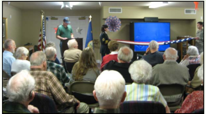
Members of the Montana Army National Guard Honor Guard present the American flag during the Waterford Veterans Day celebration.