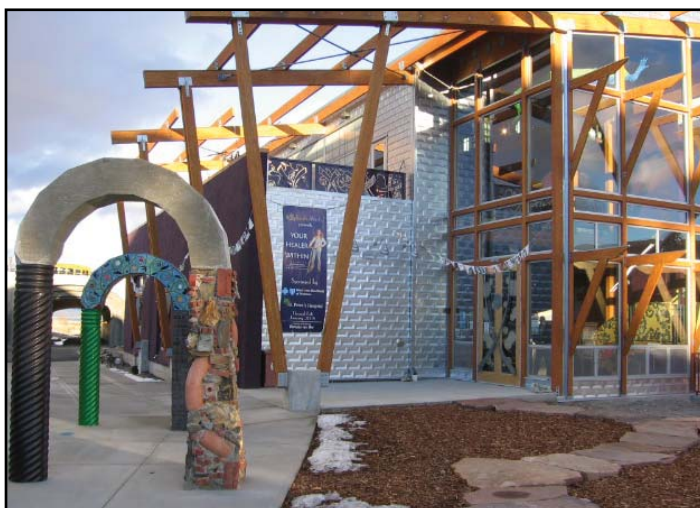
Your Healer Within exhibit and movie at the new ExplorationWorks Museum (pictured) includes interviews of Waterford residents.

The ExplorationWorks Museum recently opened in downtown Helena and includes permanent and traveling exhibits that offers educational programs for children and adults.