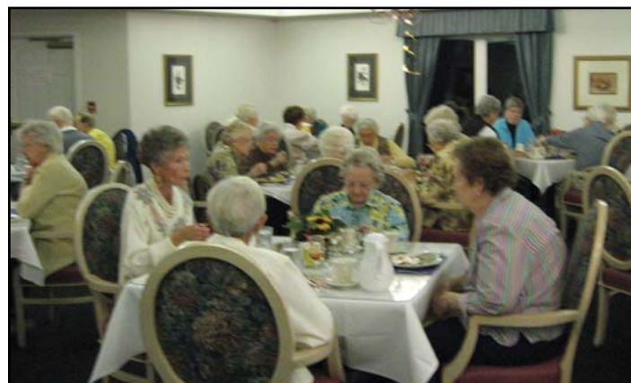
People enjoy a tasty birthday dinner.