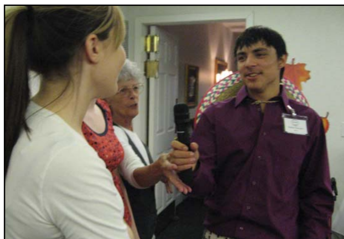
The Dining Services staff get into the spirit during a recent birthday night and sing happy birthday to residents.